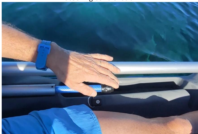
Steering control stick