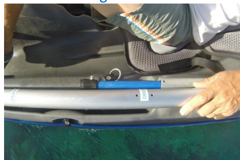
PEDAYAK DUO ELECTRIC, catamaran