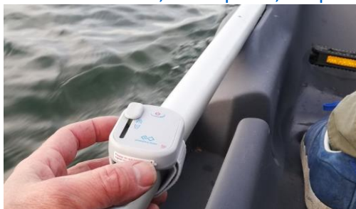
Steering control stick