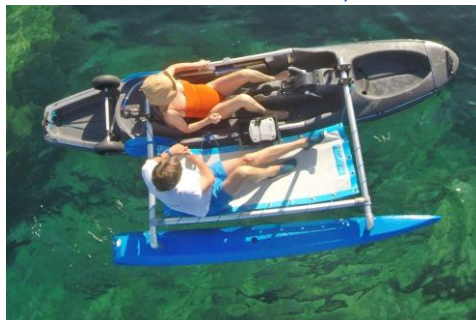
PEDAYAK PRAO ELECTRIC, a side float