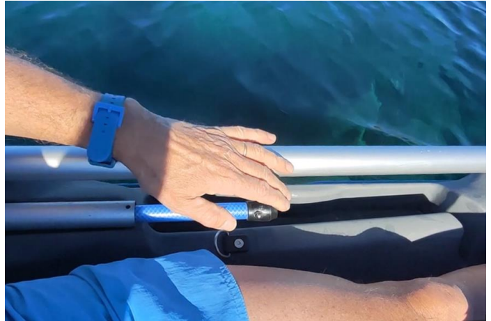
Steering control stick