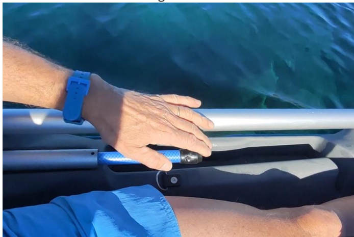
Steering control stick